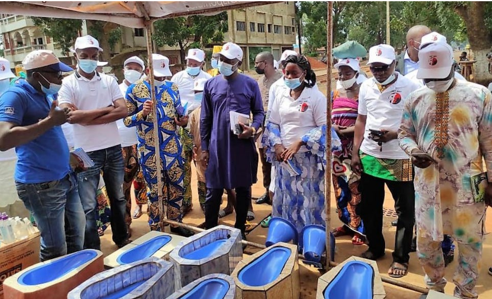
SANITATION ENTREPRENEUR SHOWCASES HIS PREFABRICATED TOILET AT HIS SHOP-CÔTE D'IVOIRE